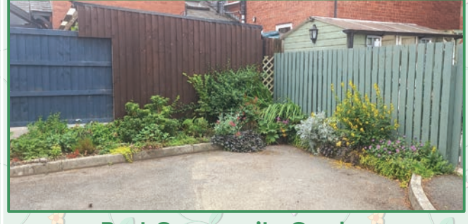
(not in a scheme) Gill Davies Caersws

Best Insect-Friendly or Eco/Wildlife Garden Feature (under 16s) Joint winners